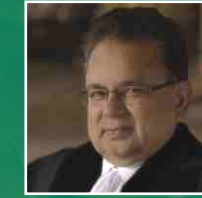
Padma Bhushan Justice Dalveer Bhandari Member, International Court of Justice