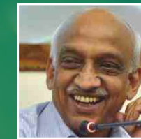
Padma Shri A. S. Kiran Kumar Chairman ISRO