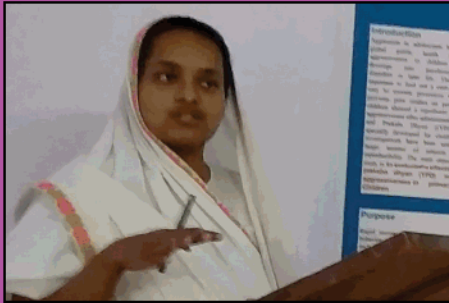
Mumukshu Madhumita Purification of Aural Coloration: A pathway to liberation.